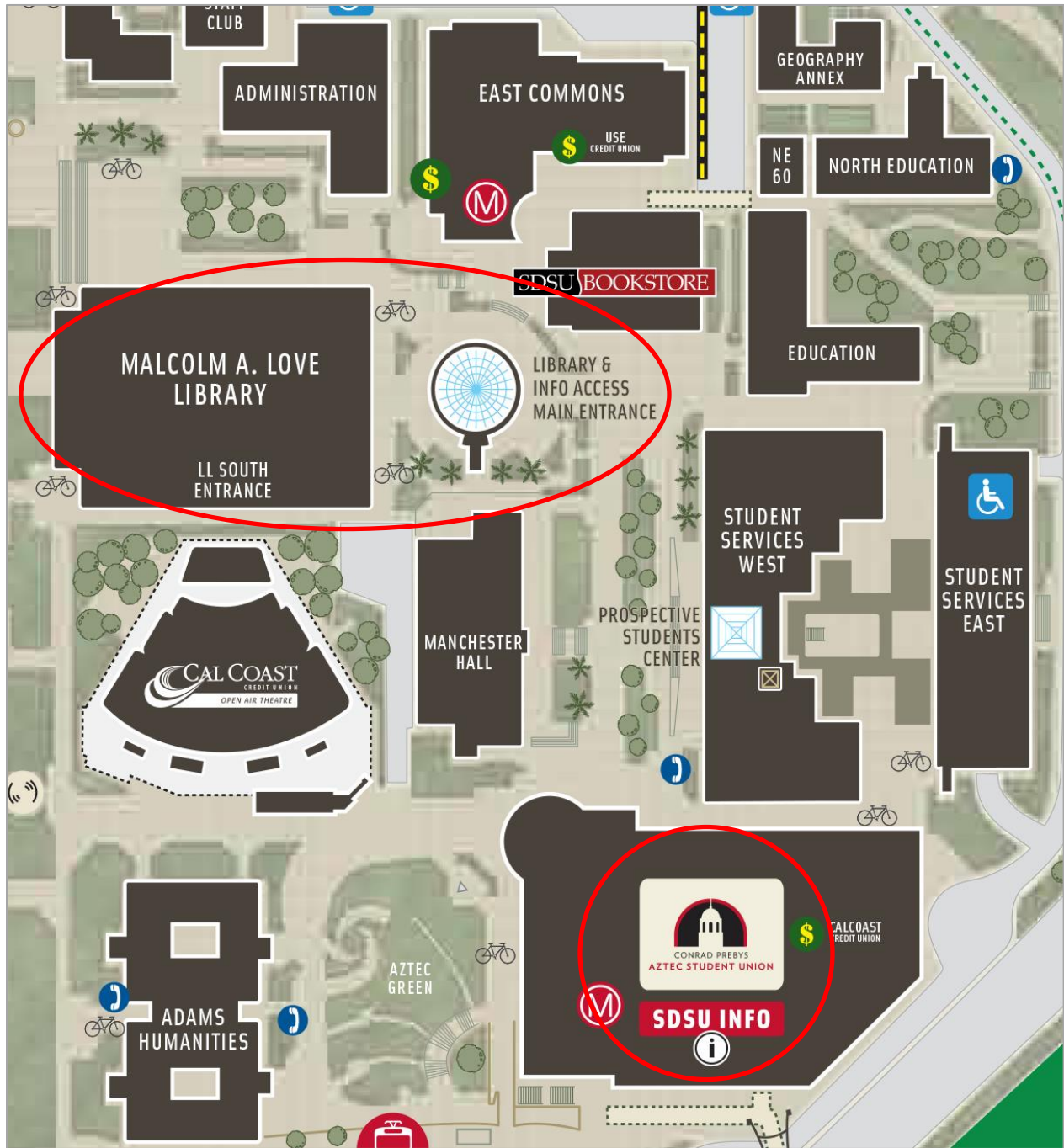
Map of Aztec Student Union (Templo Mayor, Room 231) and Love Library (Rooms 410, 430, 431 and Addition Rooms 76, 78)